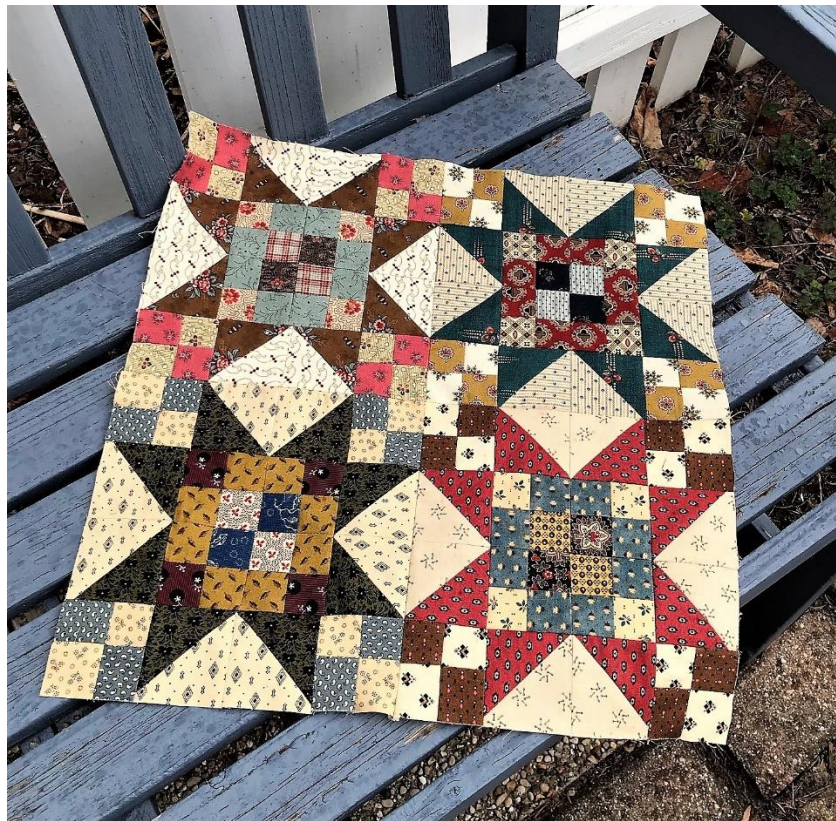
Next month, we'll add 2 borders and complete the quilt.