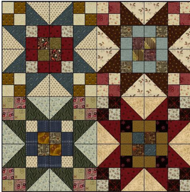
Ta-da! I am calling this quilt Star Gazing.